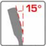
15° offset box end for knuckle clearance.